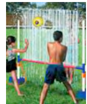
Discovery Volleyball 'N Lim Set

• Endurance 2 • Endurance Newsletter Sign up • Discovery Kids on NBC / Discovery Kids Channel • Discovery Channels • NBC Highlight • In Theaters N • TV Highlights • Fun & Games • Message Boar • Parents • Study Guides • Teachers • Make AIA the Family Screen Scene Your Hon Page.