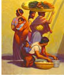
KIDS FIRST!® Junior Jurors

Discipline - Purple Team. Heart - Green Team. Teamwork - Yellow Team.