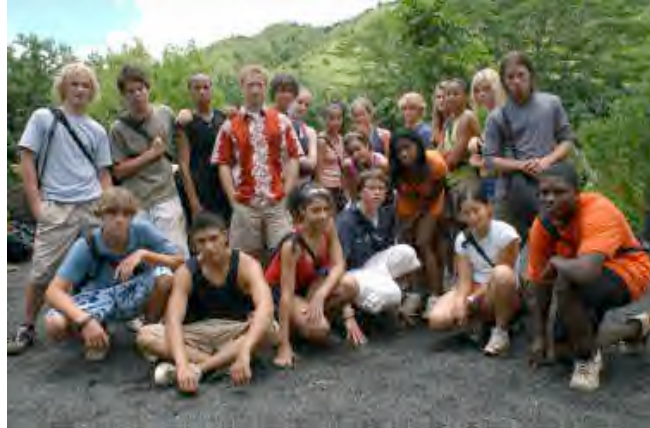
This year's competitors gather together in Hawaii.

The official casting of Endurance 4 has begun. Deadline is April 15. ENDURANCE AUDITIONS